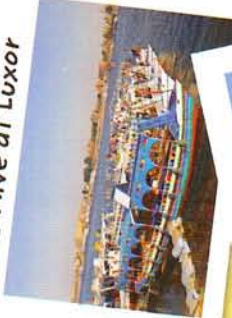
Nile Rive at Luxor