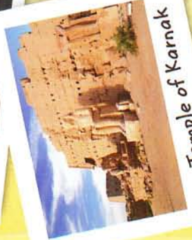
Temple of Karnak