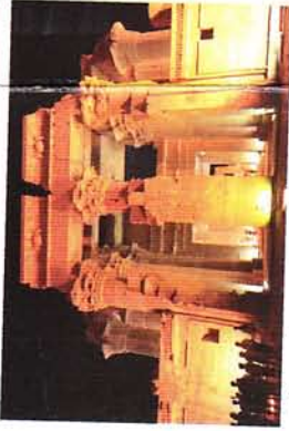
Temple of Kom Ombo