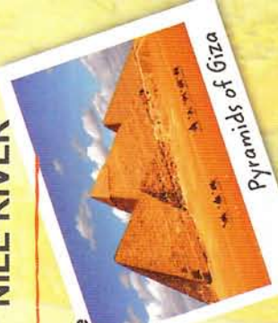
Pyramids of Giza