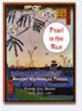
Pearl in the Rice