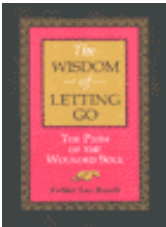
The Wisdom of Letting Go