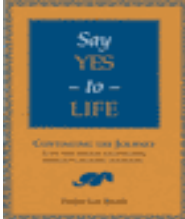
Say Yes to Life 10 week workbook: Continuing the Journey