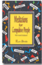
Meditations for Compulsive People