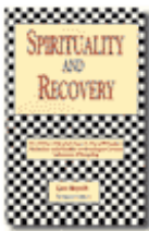
Spirituality and Recovery