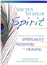
Say Yes to Your Sprit