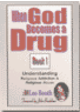
When God Becomes a Drug: Book I