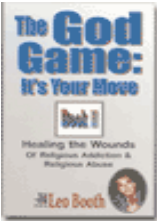
The God Game: Book II