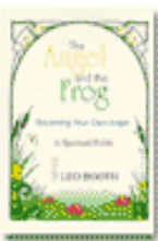
The Angel and the Frog